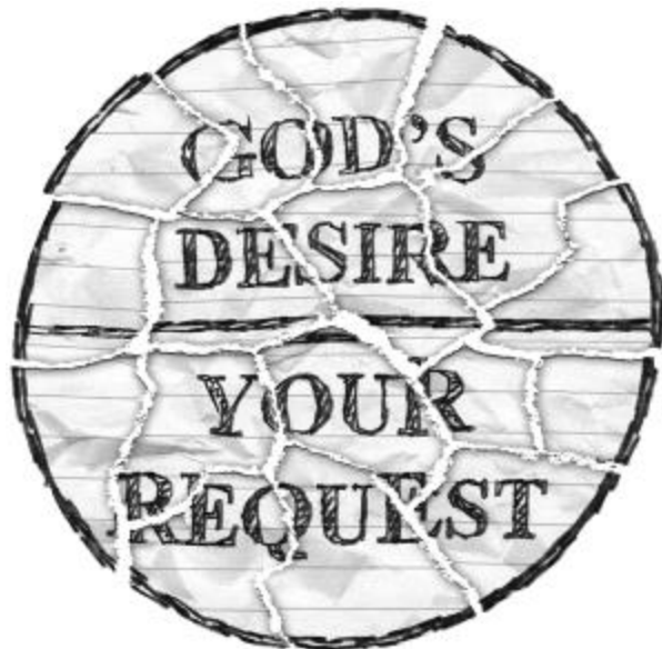
My Church's Understanding of God's Will/Purposes