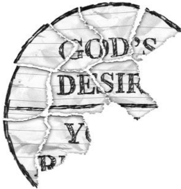
My Prayer Group's Understanding of God's Will/Purposes